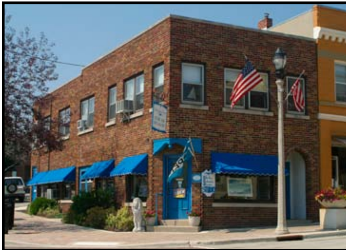
Shirley Gruen Studio/Gallery